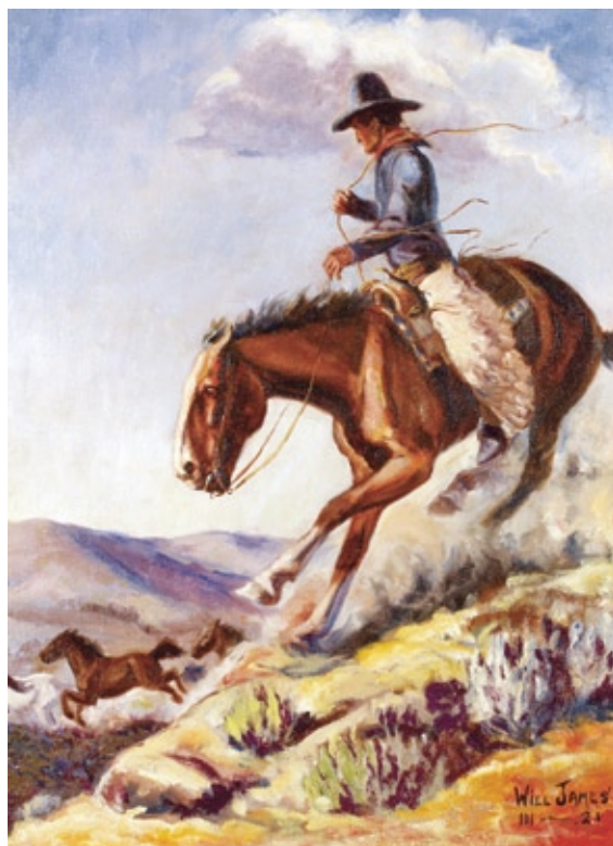
Will James, Wild Horses , oil on board Estimate: $50/100,000 SOLD: $149,500