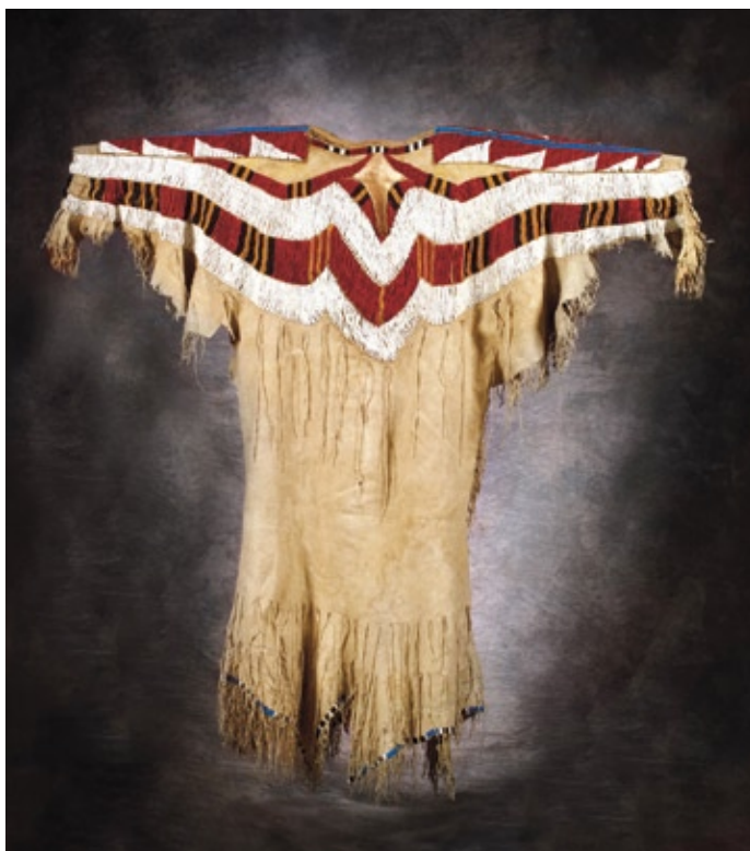
Circa 1860 Plateau Pony Beaded Shirt Estimate: $40/80,000 SOLD: $74,750